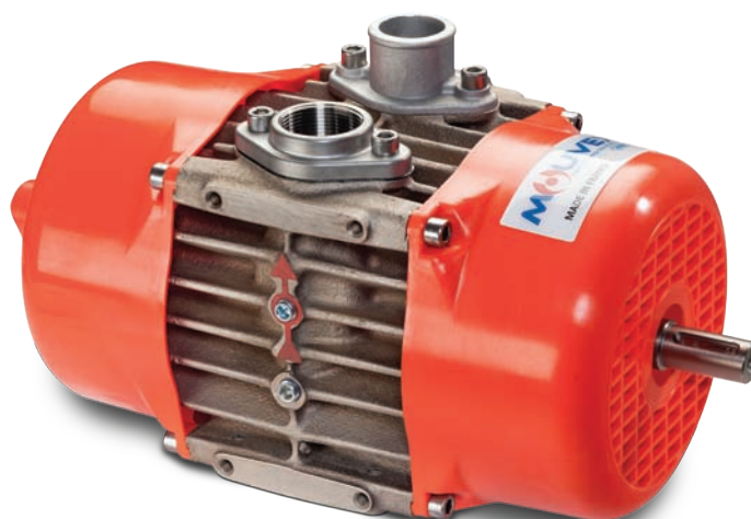
E140 Vane Compressor

Weight: 36 kg (79 lbs.) to 47 kg (104 lbs.)