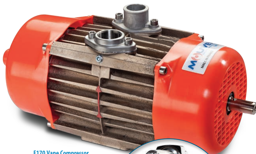
E170 Vane Compressor