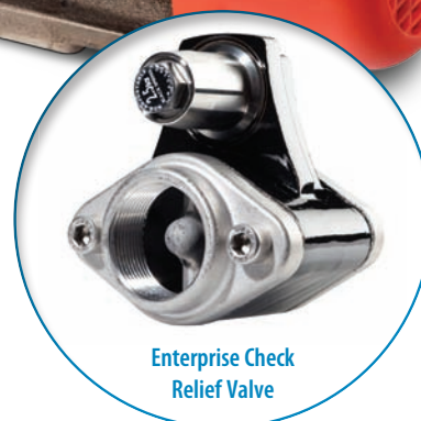
Enterprise Check Relief Valve