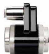
Enterprise Check and Relief Valve (Delivered with Enterprise Series)