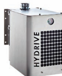
Hydrive Hydraulic Cooler (optional)