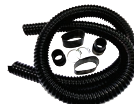
Inlet Connection Kit (Delivered with Enterprise Series)