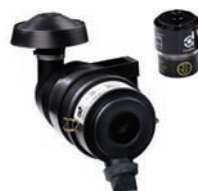
Suction Filter (optional)

The Enterprise Series compressors are available in PTO or Hydraulic Motor drive versions. Accessories available include: