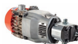
Option: Enterprise with Hydraulic motor drive adaptor